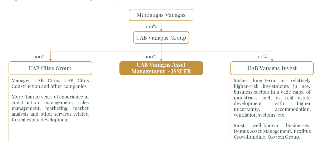
Figure 2. Structure of Vanagas Group

The structure of Vanagas Group companies has been designed to differentiate them according to three main areas of activity. This comprehensive structure enables the Vanagas Group to efficiently manage risk while capitalizing on market opportunities in various sectors: